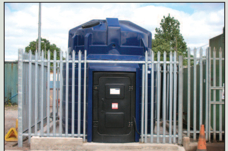
New AdBlue tank